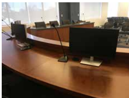
New Installation for RVSD