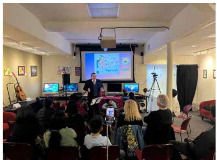
Workshop at the media center