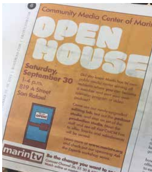
Open House Announcement