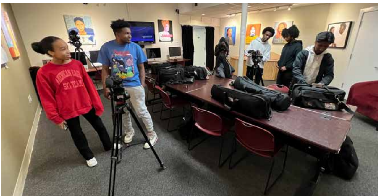
Field Camera Workshop

CMCM has been granted three years of Funding via the Marin Community Foundation's Community Power Initiative. We intend to direct this toward our Youth Media Academy and strengthen the courses/curricula offering and increase outreach to Marin's disadvantaged student community. Students will learn field and studio production and post-production editing workshops in a safe environment geared toward hands-on training and personal growth. With these skills they can continue to use the facilities of the media center to produce their own work.