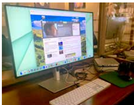
New edit stations at the Media Center

CMCM provided staff operators for over 600 County and City meetings over the course of the fiscal year. We are one of only three PEG center in the country providing such extensive service to multiple municipalities and agencies (most PEG centers serve only one city).