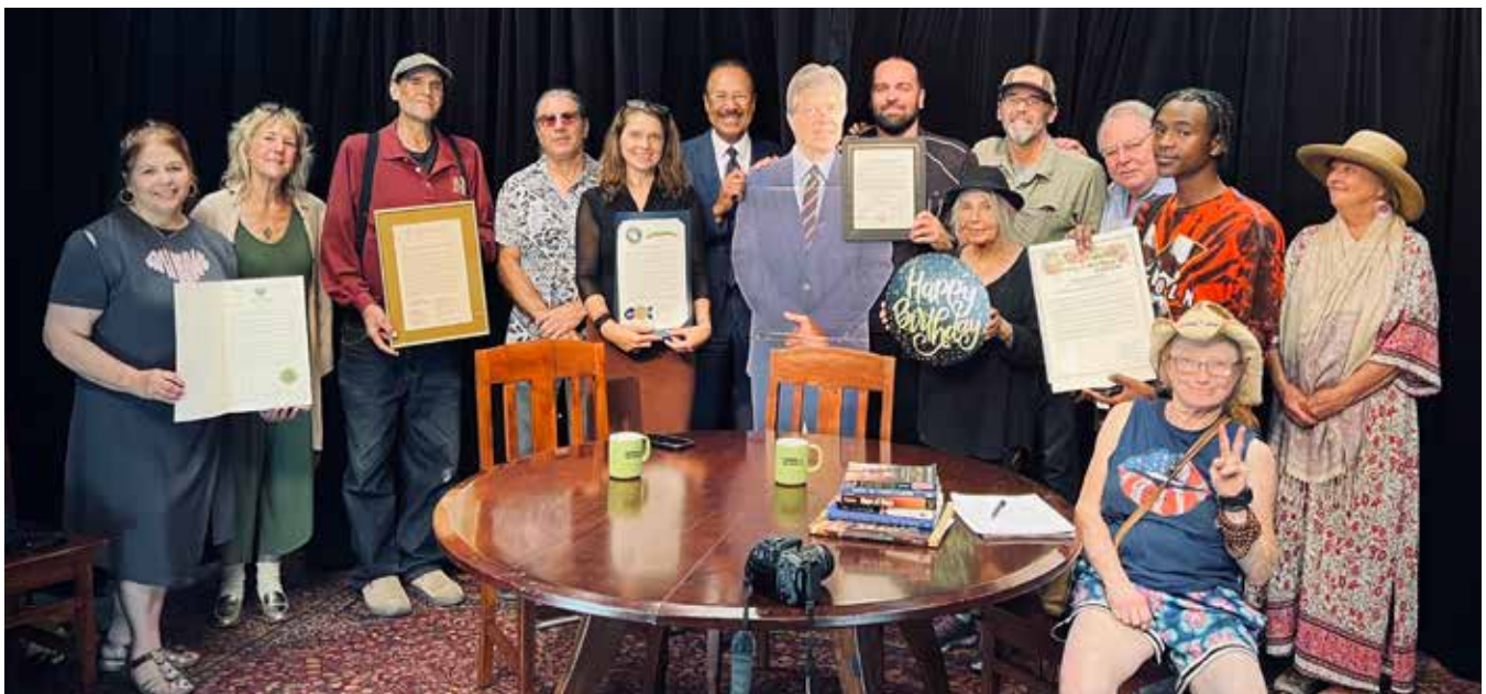
Jimmy Carter 100 Year Live Studio Program

CMCM has an “Express Studio” that provides for a one-person production operation. The podcast room serves as a conduit for people to single-handedly produce a show live or recorded in the popular and evolving podcast setting. The host can have a solo show with guests in the room, and/or via Zoom from any where in the world.